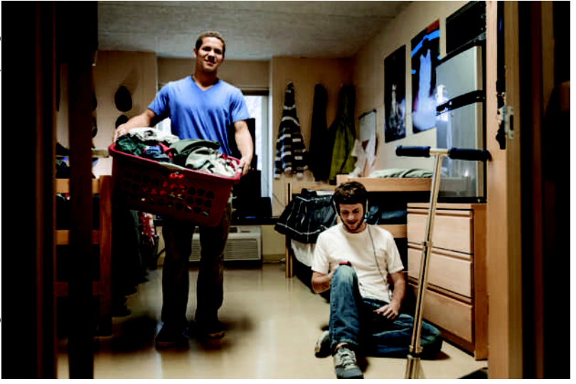
Adjusting to College Life College life can be liberating and energizing, and then, especially for residential students, there's the laundry. For returning students, of course, laundry may have been a standard part of life for decades and simply continues to demand its time and place.

The challenges of life touch all of us at one time or another. That is what this book is about: adjusting to challenges as we get on with the business of living—growing, learning, building relationships, making sense of our value systems, establishing careers, making ends meet, and striving to feel good about ourselves. This book portrays our quest for self-development and brings psychological knowledge to bear on problems that may block personal growth. Some of these problems, such as anxiety, depression, and obesity, are personal in nature. Some are interpersonal, involving intimate relationships and sexuality. Others involve the larger social context-the workplace, prejudice and discrimination, environmental disasters, pollution, and urban life. (See photo.)